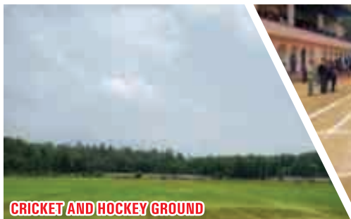
CRICKET AND HOCKEY GROUND