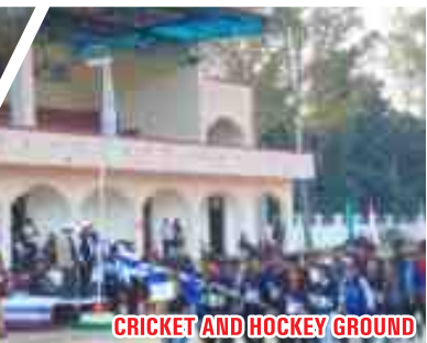
CRICKET AND HOCKEY GROUND